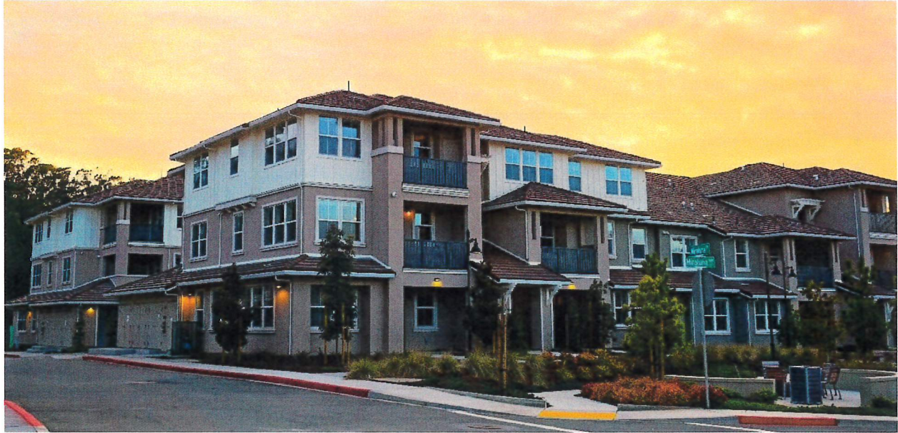
Skyline Ridge at Skyline College, City of San Bruno