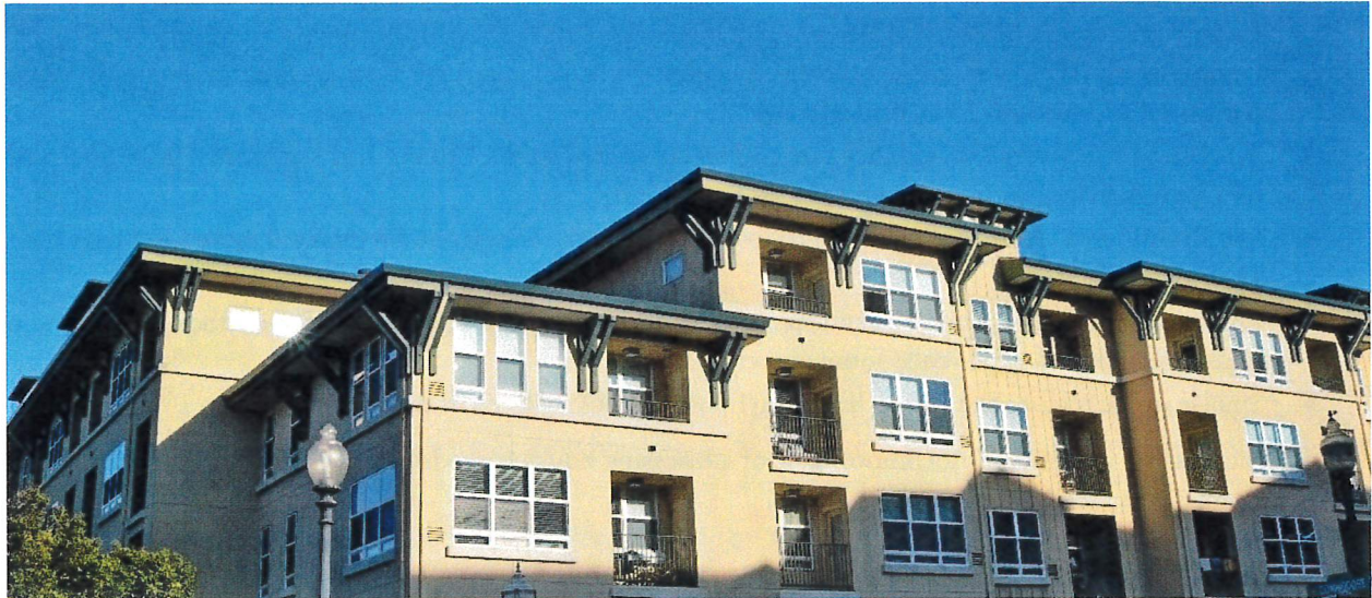
Avalon Apartments At The Crossing, City of San Bruno

San Bruno is a modest sized city with diverse geography, pleasant year-round climate, and a strategic location from a transportation standpoint with proximity to San Francisco International Airport, a BART station, CalTrain station, and high-quality transit corridor along El Camino Real. The City has modest fiscal resources, but is committed to improve local housing conditions, exceeding State requirements where possible.