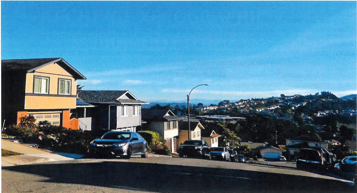
Portola Highlands Neighborhood, City of San Bruno

San Bruno is committed to implementing housing policies that expand and preserve our housing stock, encourage greater access to housing, and minimize the displacement of vulnerable residents. To that end, this Housing Element outlines an implementation plan through goals, programs, and implementing actions. Goals are long-range, broad, and comprehensive targets. They are not necessarily measurable or achievable in the planning period; rather, they describe the overall future outcome the community would like to achieve. Policies are focused and specific instructional guidelines. The goals and policies are implemented through a series of implementing programs. Programs identify specific actions the City will undertake toward putting each goal and policy into action.