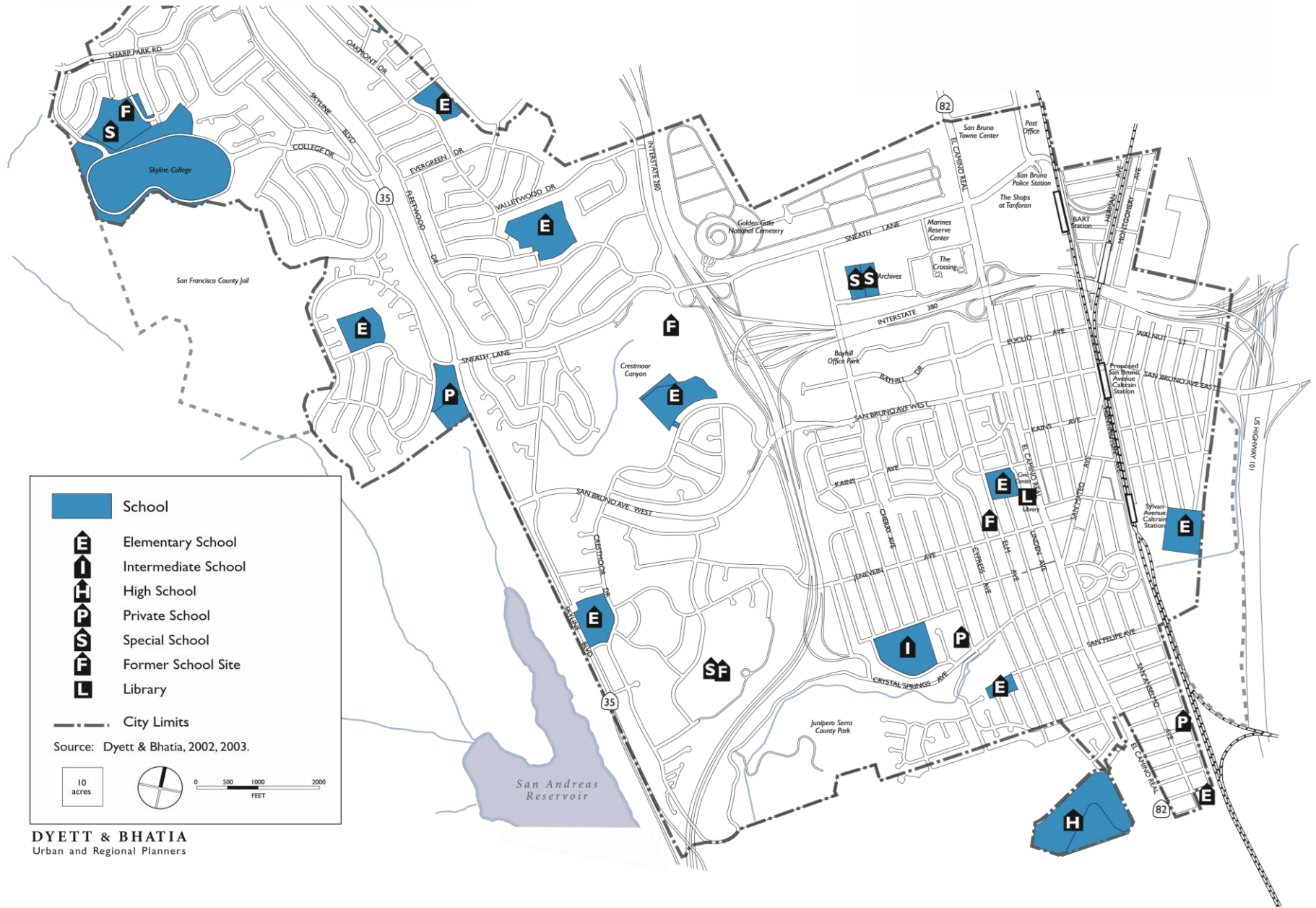
Figure 8-3: School Facilities & Library

DYETT & BHATIA Urban and Regional Planners