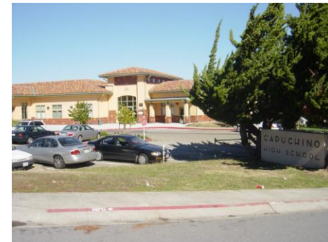
Existing schools such as Decima Allen Elementary School (above) and Capuchino High School (below) will continue to experience pressure related to population growth and new development.