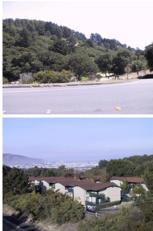
Fire protection and emergency response comprise two of the most important roles of the City. High risk fire hazard areas include lands where natural hillsides and woodlands are located adjacent to urban uses (Junipero Serra Park, top, and nearby multifamily development, bottom).

management activities, the EOP identifies the organizational structure used during an emergency, provides guidance on specific position duties within the Emergency Operations Center, and helps the City manage a variety of situation types. to coordinate all departments of first responders (police, fire, medical). For more information on emergency operations and response, including evacuation routes, please see the Emergency Operations Plan.