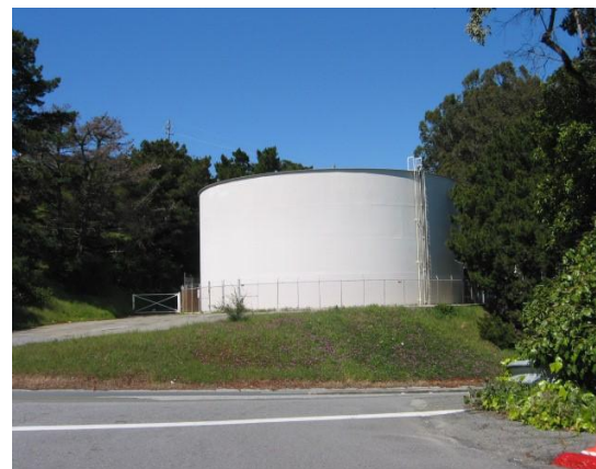
San Bruno's water supply comprises a blending of water from local wells and purchases from the San Francisco Public Utilities Commission. Municipal water is stored in eight storage tanks (shown) throughout the city.

The City of San Bruno uses approximately 4,228 million gallons of water per day (mgd). Per-capita consumption averages approximately 75-57 gallons per day (gpd) in the wet season and 125 gpd in dry weather.