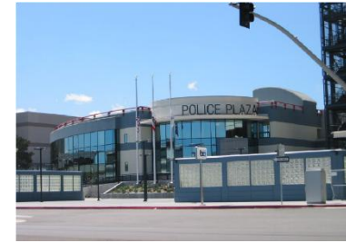
Public safety services are provided through the San Bruno Police Department (Police Plaza at the San Bruno BART Station, top) and the San Bruno Fire Department (Station No. 52 on Earl Avenue at Sneath Lane, bottom).

Buildout of land uses according to the General Plan would result in an additional 23,901 pounds per day, or 4,362 tons per year, of solid waste. The city's total 2025 waste stream is projected at 44,654 tons per year—an increase of nearly 14 percent over the next two decades.